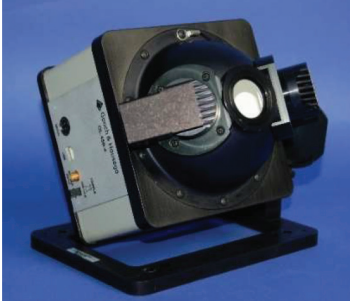
OL 458 SHOWN WITH OL 458-MOUNT OPTIONAL ROTATIONAL MOUNTING SUPPORT

White LED-Based Fixed Luminance Sphere Calibration Standard