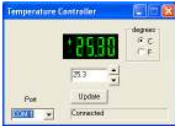
Software interface for the OL 700-88TC in the OL 770 Application Software

The advent of high brightness LEDs and other solid-state lighting sources has created challenges for thermal management for device developers and lighting designers who create or implement such devices. In response to this need, Gooch & Housego has developed the OL Series 700-88 Temperature Controlled LED Holders, which utilize recirculating liquid to dissipate the heat from the more powerful new LED devices. The holders are used with the OL 700-88TC Liquid Cooled Temperature Controller, which maintains device temperature by recirculating chilled or warmed water through the holders. Changes can be made manually using the front panel display on the controller, which shows the set point temperature and the temperature of the portion of the holder in contact with the device under test (DUT). With the OL 770 Application Software, the temperature set point may be programmed and the device temperature can be displayed as part of the value tree. The data can then be easily exported to Microsoft Excel ® and Word ® for analysis or report generation. The OL 700-88 holders are compatible with the OL IS-670 and OL IS-1800 Integrating Spheres, and OL 15AB LED Receptor. Use with the OL 700-30 Goniometer is not recommended.