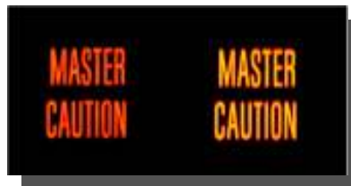
Actual Measurement Data and Display from Master Caution Light

The OL 770-NVS Application Software allows for turnkey automated operation while providing the user with easy and complete access to the system's full power and capabilities. Software features include: